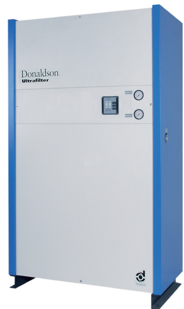
ALG 35 S