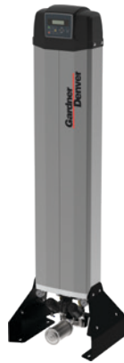
GDX7M -40°C DS to GDX50M -40°C DS Series Flowrates from 0.67 m 3 /min