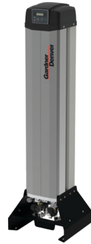
GDX7M -70°C to GDX50M -70°C Series Flowrates from 0.67 m 3 /min